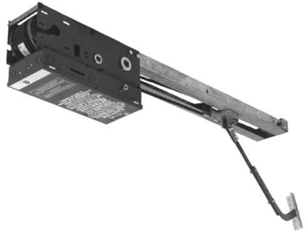
Commercial limited duty belt drive trolley operator