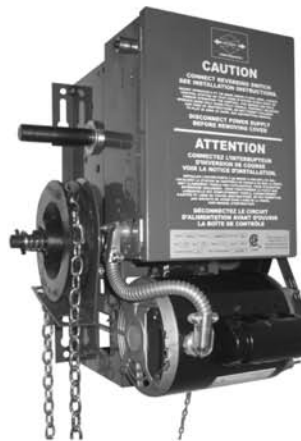
Commercial/Industrial continuous duty belt drive jackshaft operator with emergency chain hoist