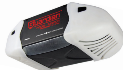
MODEL 628FCA 3/4 HPe DC MUSIC GDO