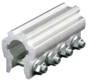
COUPLERS & COLLARS