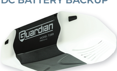
MODEL 728B 3/4 HPe DC BATTERY BACKUP