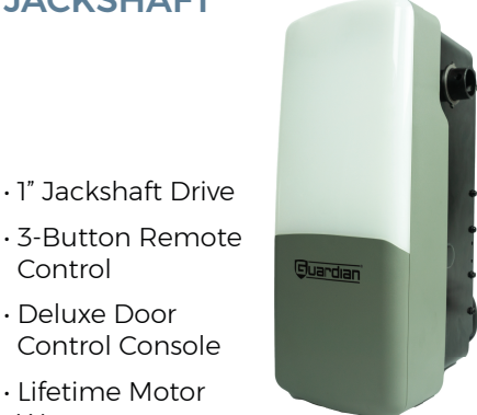
928 RESIDENTIAL JACKSHAFT