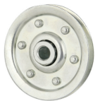
BEARINGS & PULLEYS