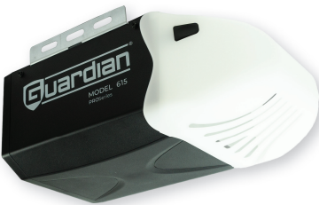
MODEL 615 1/2 HPe DC