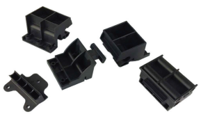
CDG QUICKFIT SYSTEM