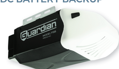
MODEL 715B 1/2 HPe DC BATTERY BACKUP