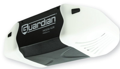
MODEL 628 3/4 HPe DC