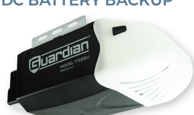
MODEL 715BBU 1/2 HPe DC BATTERY BACKUP