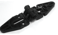
PLASTIC HINGE SYSTEM

1,158 YEARS OF SERVICE BUILT INTO EVERY ONE.